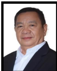
Rodolfo Abellana Vocational Service