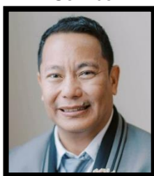
Litho Mojares Service Projects